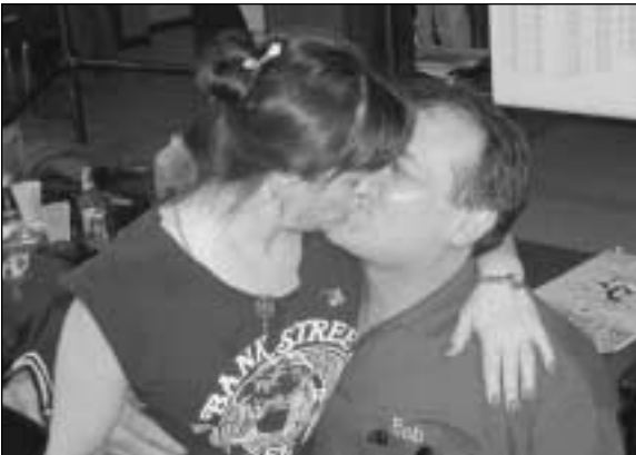
WELL, WELL, WHAT DO WE HAVE HERE?