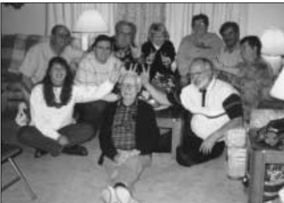
CAN YOU NAME ALL THESE DARTERS?